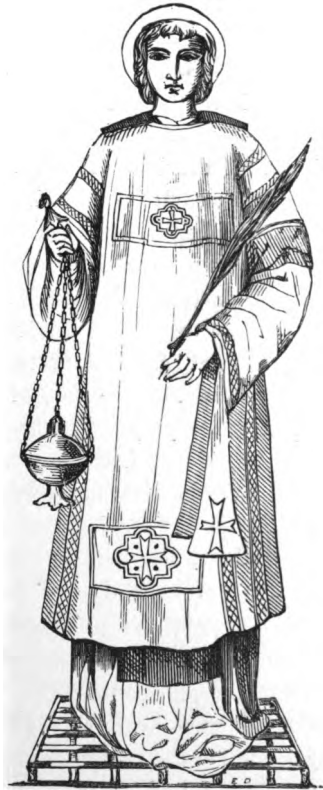
S. Laurence ( Vivarini ).

when thou hast admitted me to be with thee at the consecration of the Blood of the Lord? Abraham offered his